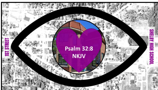
Depiction of the “eye of God,” as described in the letter.