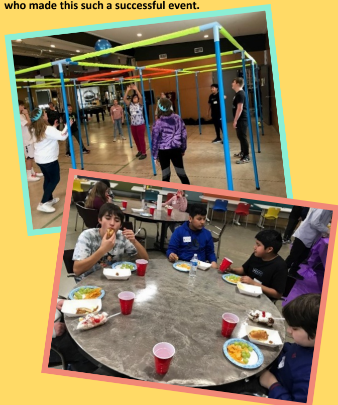
Top Photo: Youth and adults had a blast playing 9 Square in the Air. Bottom Photo: After the game, everyone gathered in the café to eat chili-cheese dogs, banana splits and root beer floats.

We topped off the celebration with chili-cheese dogs, banana splits and root beer floats. Coach Love gave a life-changing message of hope to all students who attended. There were many new faces at this celebration, some of whom are now attending The Ladder regularly after school. We are thankful for the generosity of New Era Reformed Church in allowing us to borrow their 9 Square in the Air equipment, as well as our staff and volunteers who made this such a successful event.