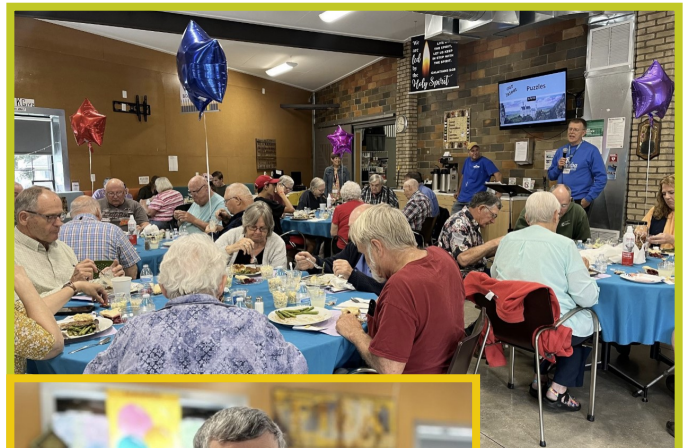
Above: We served 53 meals at our Father's Day Luncheon June 12.

We are grateful for all the opportunities God gives us to honor people at The Ladder, especially parents!