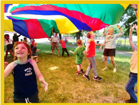
Working together, we raised the parachute!

During the last week of school, the mentors, prayer partners, and Kids Hope kids gathered for a