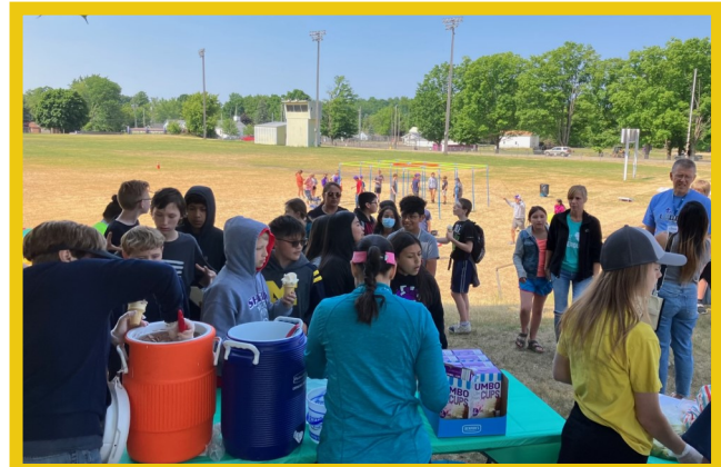
We went through almost 16 gallons of ice cream at the After School Bash!