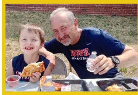
Pizza, ice cream, and sunshine... an awesome day!

As we pause to celebrate the gift of Kids Hope, we also wonder, are you the next Kids Hope Mentor?