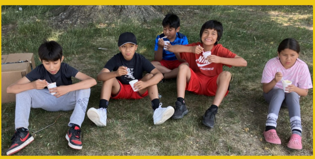
Elementary-aged kids enjoyed ice cream together during a break from the fun activities at the Bash.

The Ladder is grateful for our beautiful community. Together we are making Shelby stronger, bringing people together with events like the After School Bash. If you or your organization would like to partner with The Ladder at future events, please reach out to us by emailing info@theladdercommunitycenter.com or calling (231) 259-0211.