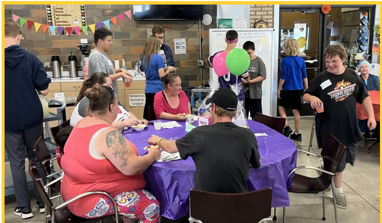
Ladder youth honoring their families by serving them. Happiness and love—these smiles say it all!

Fifty people attended the event. It was an evening full of fun, food, prayer, devotion, and love. We shout out a huge THANK YOU to God, our youth, their families, our volunteers, donors and mentors. We truly appreciate your time, commitment, support and love – a perfect recipe for success.