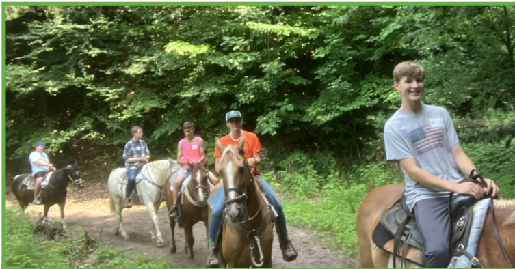
Happy trails for Ladder youth.

Our summer youth program is called Summer Break Out. There is learning, pleasure and serving in heaven, all of which happen at Summer Break Out. From June through August, Mondays, Wednesdays and Fridays were GROW days. We opened God’s Word and learned truth. Tuesdays were GROOVE days. We went horseback riding, high-rope climbing, bike riding and had many other fun adventures. Thursdays were GO days. We went into the community and served by pulling weeds, washing cars, sweeping walkways and baking cookies. In other words, we experienced some heaven on earth, and what a pleasure it was to see how it impacted our youth!