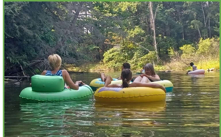
Tubing toward Lake Michigan—almost heaven!

The printing of this newsletter (July-August 2023) was made possible by an anonymous donor.