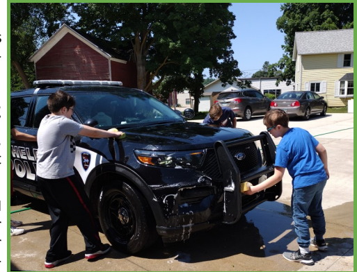
Shining up the Sheriff. An eighth grade youth said, “This is the funnest thing I’ve done all summer!”

Wow, that is so true. I was so blessed to hear from the mouths of our youth how their experiences at Summer Break Out were teaching them the things of God. While Summer Break Out is almost heaven, it’s also increasing their desire for the real, eternal heaven. Your prayers, donations and volunteering are making an eternal difference. Thank you!