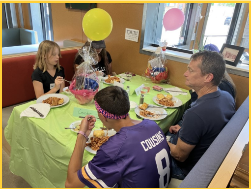
There's nothing like a dinner table to bring families together!

Ladder bag, a Ladder coffee mug, candy, popcorn, a deck of cards, card game instructions, and a note of appreciation. Our goal was to send them off with gifts that would encourage them to spend time together at home.