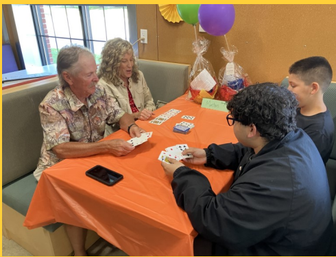
Dedicated mentors and Ladder youth connecting through friendly competition!

In July we hosted our Summer Fam Fest and Parent Appreciation Dinner. Our focus was for the youth to show appreciation and love towards their parents and families. It is important to us that parents and families know they are appreciated and loved by their children, as well as their Ladder family.