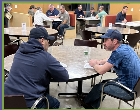
Left: Men ages 12 and up meet at The Ladder for Pit Stops every Tuesday through May.

My prayer is that the youth in our community will think back on their childhood and be able to say, "I grew up in a community full of HEROES." Join the movement, men!