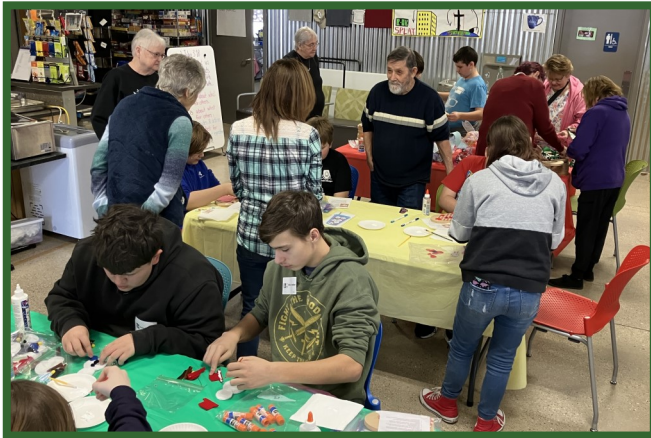
Youth and adults joined together to create three different crafts.

In the days leading up to the event, I had the youth write prayers for specific adults that had signed up for the event. Not only were the adults blessed by the prayer cards, but it also built an anticipation and excitement to meet the people for whom they had been praying. A 12-year-old girl came through the door, excited to meet the adult she was praying for, and asked, “Is Debbi here?” Debbi was indeed here, and they hit it off beautifully!