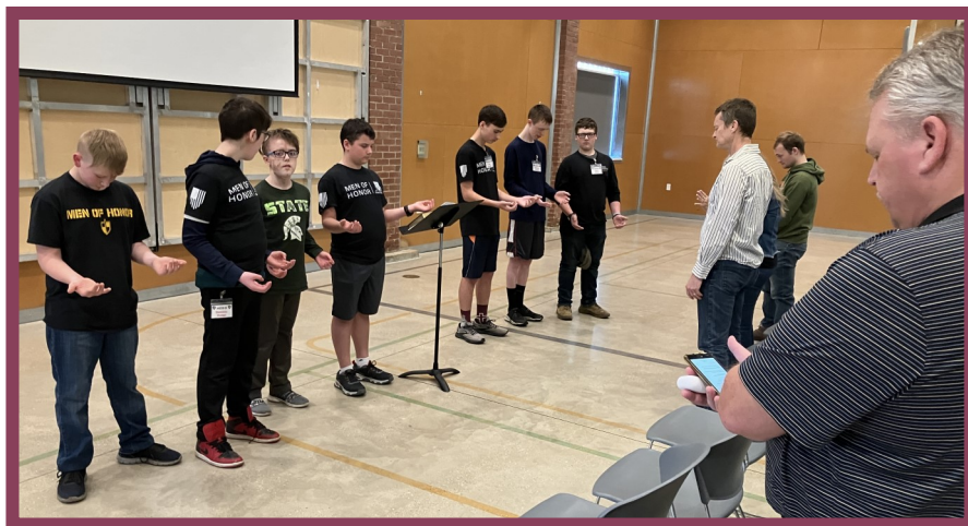
Young men receiving a blessing from a couple dozen HERO men.

I know I'm not the only one who has high hopes and dreams for the future of our community and nation. I am so grateful for The Ladder and all who support it. It is a movement that is making scripture come to life. I see our sons and daughters prophesying, young men having visions, and old men's dreams coming true!