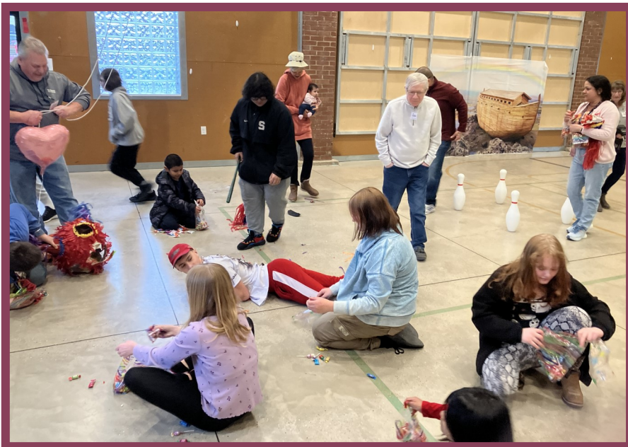
Young and old dove to the floor when the piñata burst open!

And we know that for those who love God all things work together for good, for those who are called according to His purpose.