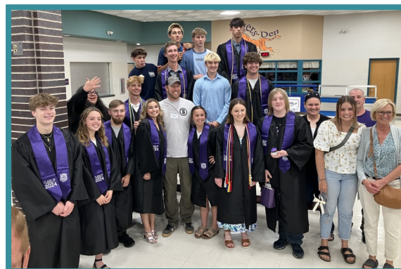
Young Life seniors and their friends after Baccalaureate.