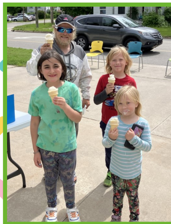
Kids of all ages love ice cream!

For one hour, The Ladder parking lot became an ice cream parlor, with music, celebration, and smiles aplenty. We served 143 ice cream cones to students of all ages and their parents. We'd like to thank House of Flavors, who donated several large tubs of ice cream for the event. One mother brought her two children, who had never been to The Ladder's youth program, Summer Break Out. Since that celebration, they have attended every day of Summer Break Out. They're meeting new friends, having a ton of fun, and learning about Jesus from the Bible every day. God does amazing things through ice cream!