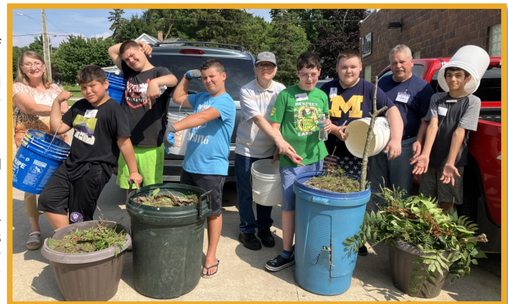
GO! Ladder youth pulled 150 pounds of weeds in 70 minutes!