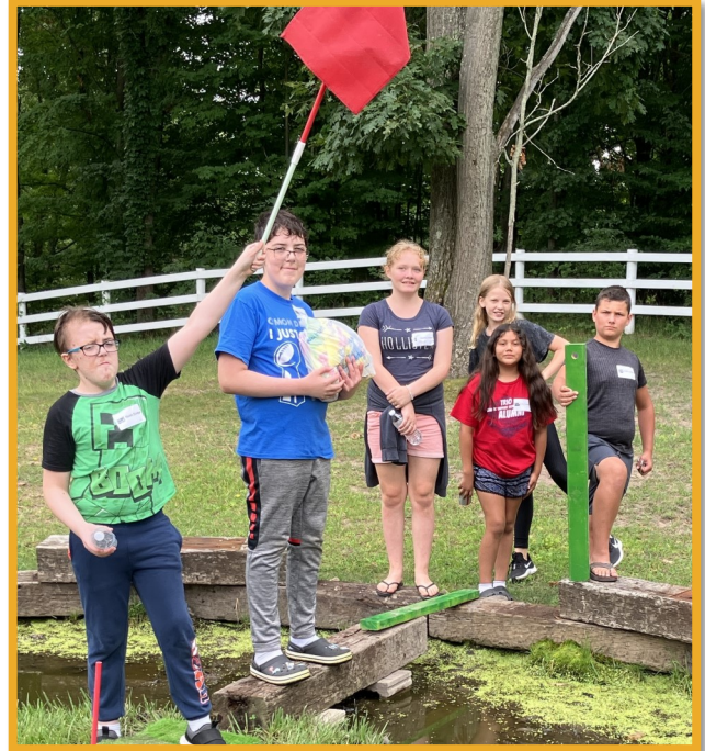
GROOVE! Youth were victorious in finding the treasure after only 37 minutes of solving all the escape game puzzles.

Break Out is young people at The Ladder loving God, serving others, and sharing the Good News of Jesus in the summer. That sounds like a successful season!