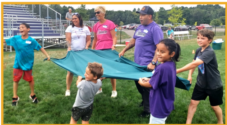
Mentors, moms, and kids came together at Shelby Township Park on a hot day to play water balloon volleyball.

Remember, we are growing trust in relationships. It will take time. But God has called us, and we persevere trusting our faithful God. He loves these families, and He loves that you have chosen to love these families as well.